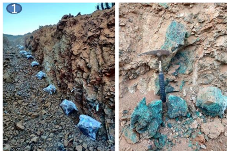
Example of systematic sampling and outcropping mineralized vein in a trench